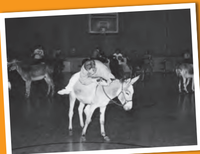
GT Donkey Archives Circa 1970's

Alumni Reunion Dinner Gordon Tech High School 3633 N. California Ave. Chicago, IL 60618