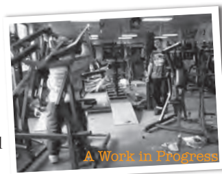
A Work in Progress